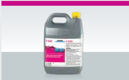
Universal detergent F300

Highly effective and economical detergents and rinse aids that precisely adapt to various applications for cleanliness and hygiene of the highest standard.