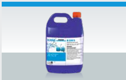
Glass washing rinse aid B200S

Liquid, alkaline, active chlorine detergent.