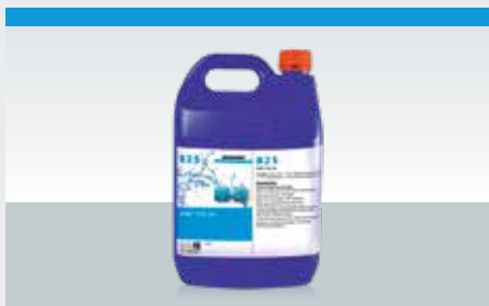
Universal rinse aid B2S

Highly concentrated, neutral rinse aid that guarantees the best possible drying results for reusable plastic cups for germ free stacking.