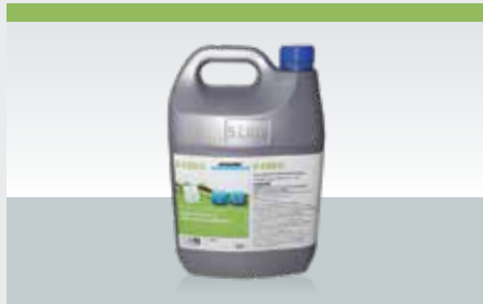
Glass washing detergent F420e

Liquid, alkaline detergent with active chlorine; ideal for removing coffee and tea stains.