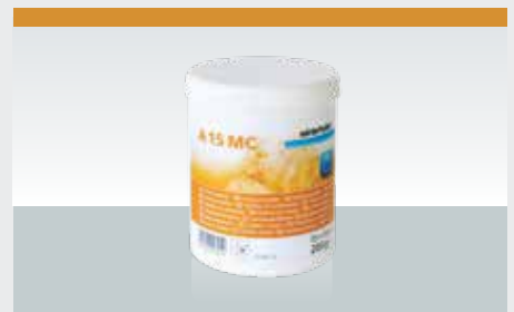
Cleaning tablets A15MC

Make sure you have spare pre-filters on hand. Charcoal pre-filter for Excellence i and AT reverse osmosis.